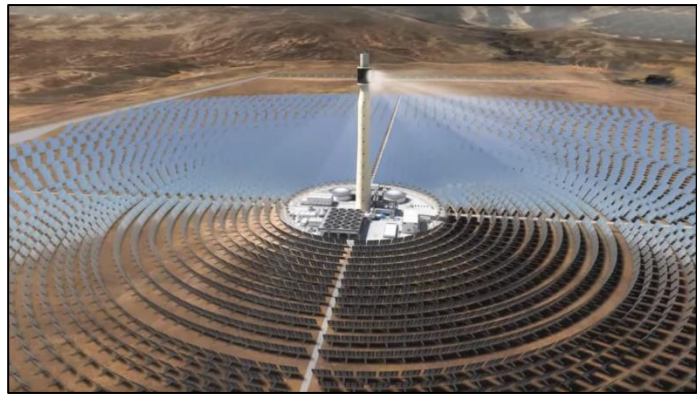
Figure 3. A concentrating solar energy generation field centered around a collection tower holding a central receiver target.

Design engineers may assume heliostat units in the energy generation field are powered by ties to a conventional electrical utility distribution grid. Control signals will be passed back and forth via conventional WiFi from small computers in each heliostat module to a central hub command computer.